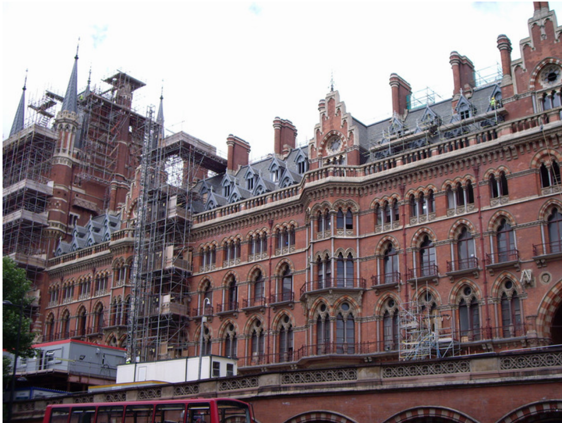
The Midland Hotel presently undergoing restoration

When viewed from the south east, the vast façade provides a five storey panorama of red brick broken by hundreds of windows which vary according to their level, the largest and distinctly ecclesiastical of which are on the lowest floors. These are framed by pointed shapes of polished Ketton stone and outlined by distinctive Gothic arches made of pale Ancaster stone alternating with brick which echo the fashion for structural polychromy much favoured by architects at the time like William Butterfield. An Italian style balustrade more appropriate for the warmth of the Mediterranean borders the main roof area which is attractively tiled in blue. This strangely romantic theme is echoed in the sprigged finials of the polished granite columns that flank many of the windows. The overall effect, however, is overwhelmingly scholarly and religious; indeed if the unsuspecting traveller was unsure of his bearings he may well think that he has been misdirected to a College of