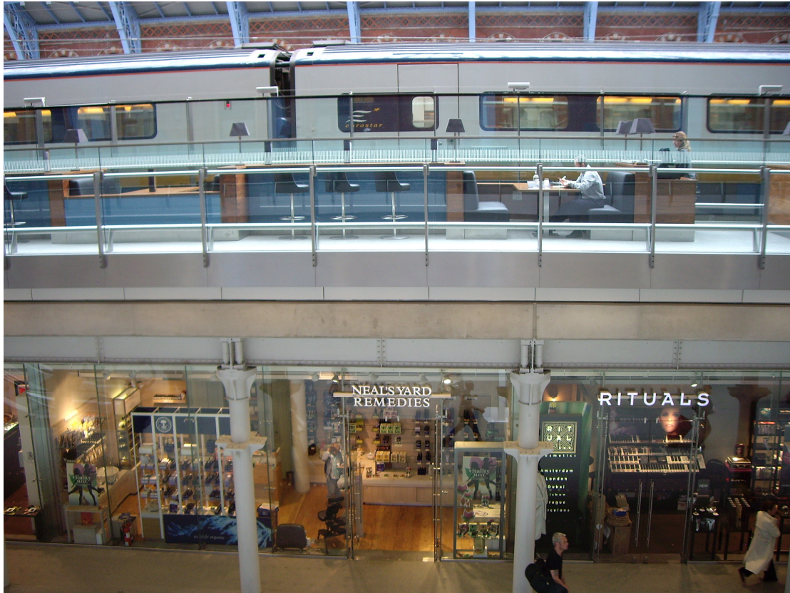
The Champagne Bar with the Arcade below.

does already, like a “grand country house” where the occupants live “mostly in the basement kitchen” (Powers,A. 2008).